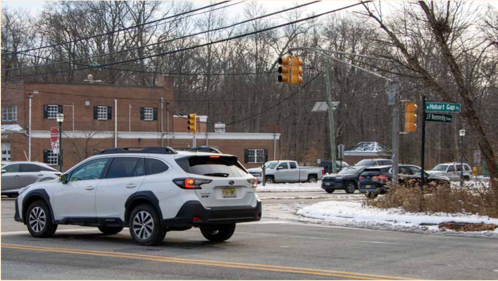
Top: Existing condition at Bloomfield Avenue and Park Place in Verona. Above: Existing condition at John F. Kennedy Parkway/S. Livingston Avenue and West Hobart Gap Road in Livingston.

PROJECT DESCRIPTION: Essex County applied to the NJTPA to fund various traffic signal improvements. Two projects are being funded focused on 18 intersections north of Interstate 280 (I-280) and 19 intersections south of I-280. Combined, the projects include installing four new traffic signals, upgrading 33 signals, implementing leading pedestrian